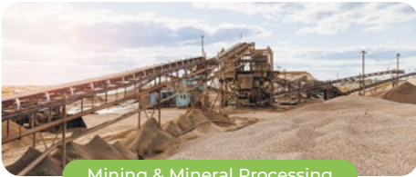
Mining & Mineral Processing

Our multidisciplinary approach ensures that each project is tailored to meet specific operational needs, leveraging the latest technology and best practices to optimise outcomes. Whether in mining, energy, infrastructure, or beyond, we collaborate closely with our clients to develop innovative, cost-effective solutions that support long-term success and environmental responsibility.